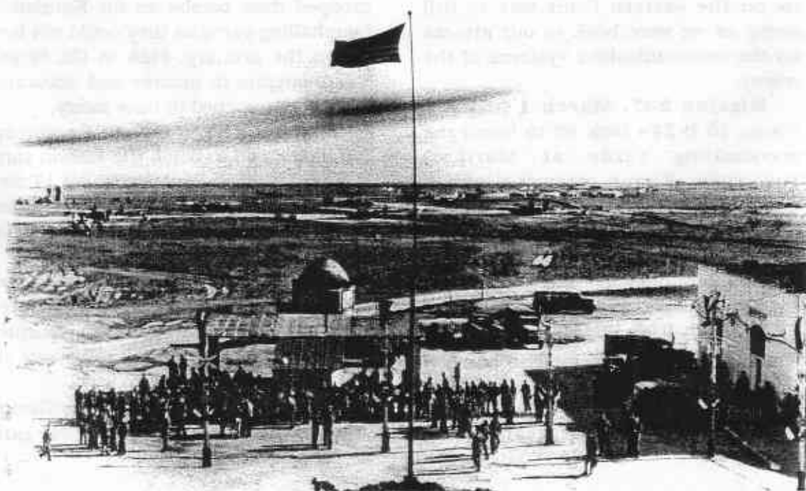
The 200th Mission Party.

By ten o'clock in the evening, the last show closed and everyone returned to their tent areas, more relaxed than before and ready for the next day's job, be it on the line, in the air or behind a desk. They had celebrated the 200th mission for this veteran Bomb Group!